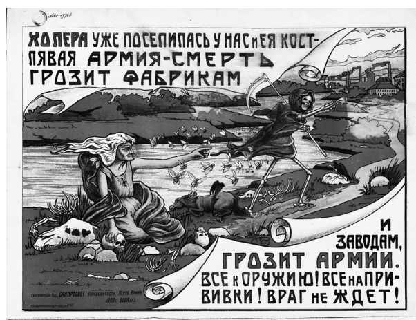
Fig. 3. A flyer on “Personal protection measures against cholera”. (Department of Public Health Education, Novgorod, 1921). 37 GA RF. F. R9550. Op. 4. D. 3320. L. 1.

An important aspect of public health education in the RSFSR was the organisation of museum and exhibition work. The establishment of permanent institutions (museums and public health education centres) made it possible to collaborate in all areas of public health education and to involve interested members of the public.