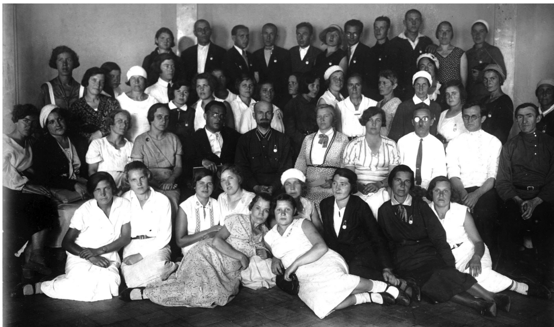
Fig. 2. Participants in the first courses for public health managers (1934).

to be carefully chosen, taking account of the audience and local epidemiological and public health situation. Learning about the principles of hygiene began from the pre-school age, when children were first introduced to the basics (the need to maintain cleanliness, wash hands, etc.). The teaching and involvement in various health measures continued in Pioneer organisations, at school, in the army (among both conscripts and the officer and command staff 28 ) and the workplace.